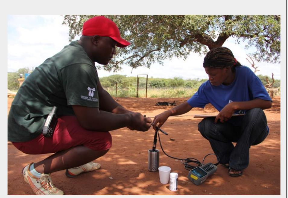
A trained network of local environmental monitors collects water quality data in HaMakuya.

Four years later, Miller is president of Pivotal Places, a nonprofit she and others from the trip founded to promote community-led change and long-term sustainability. Its name refers to harnessing the power of the critical moment when a community is on the verge of success yet still hanging in a precarious balance – when action or inaction can make it or break it.