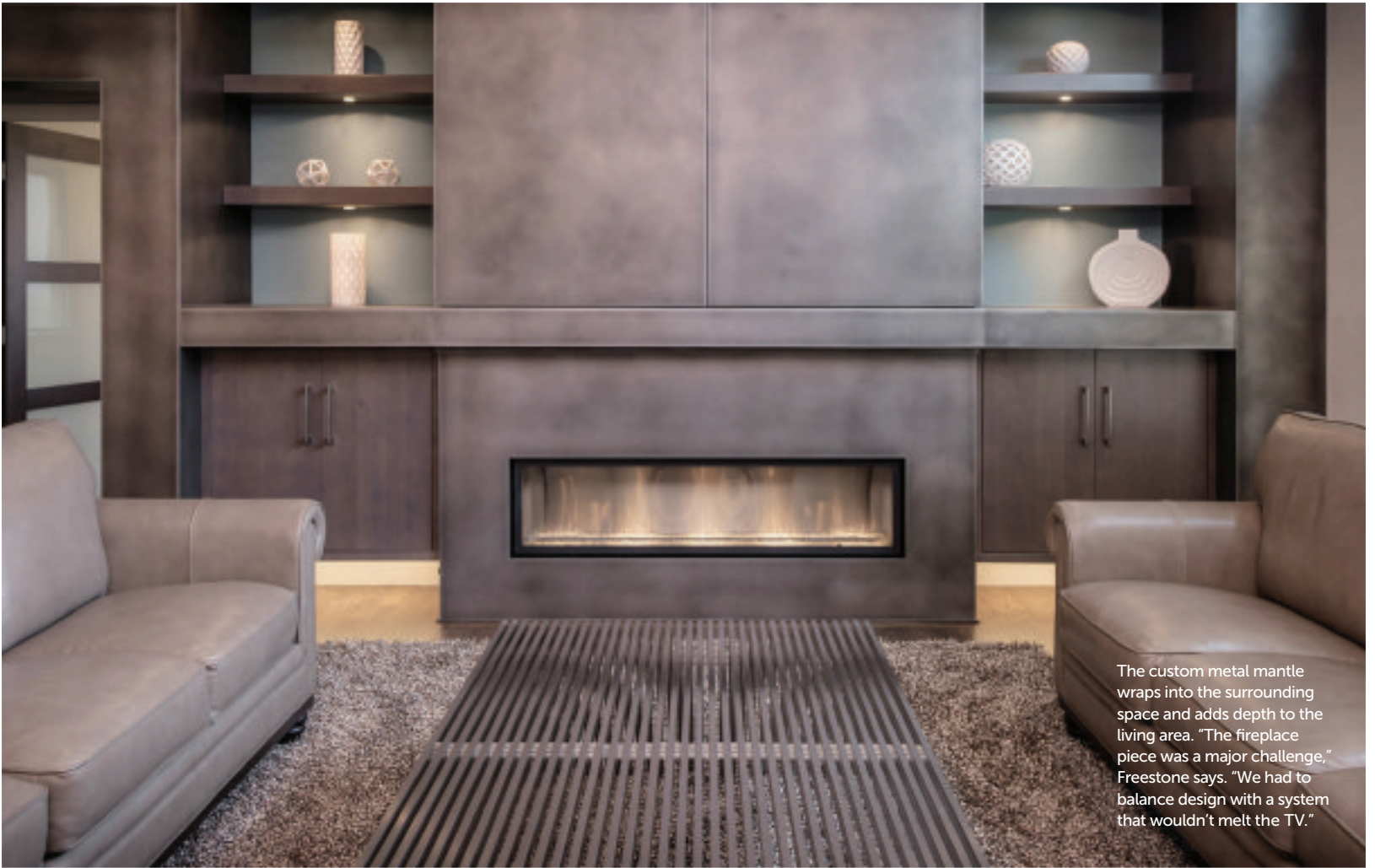
The custom metal mantle wraps into the surrounding space and adds depth to the living area. "The fireplace piece was a major challenge," Freestone says. "We had to balance design with a system that wouldn't melt the TV."

Beyond the metal wall, the master bedroom is softened by custom bedding with fur accent pillows and a paneled headboard made of crocodile-patterned leather. The expanded master bath has a special steam generator that can fill the shower with steam for a wet sauna experience. In his and hers side showers, benches allow them both to recline in the steam.