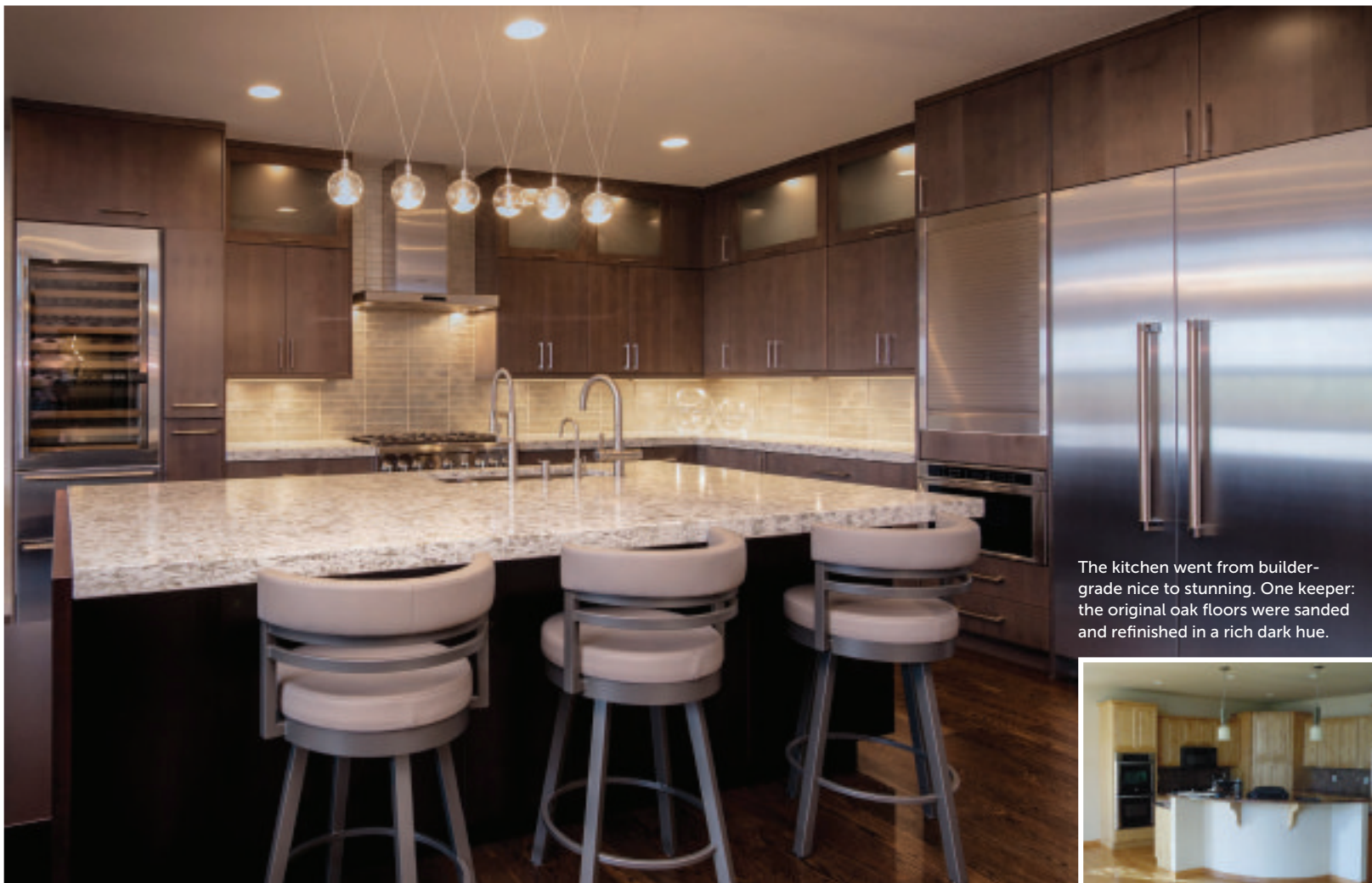
The kitchen went from builder-grade nice to stunning. One keeper: the original oak floors were sanded and refinished in a rich dark hue.

A ho-hum patio home gets a luxurious high-tech makeover. BY RHEA MAZE